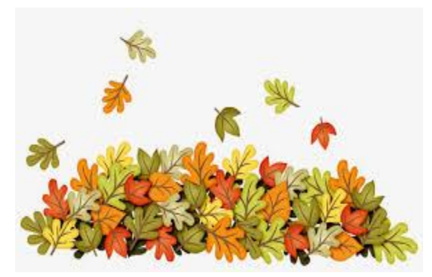
Notes from Your PTO

1 All Souls' Day 1 Daylight Savings Time Begins 2 All Saints' Day 4 Feast Day of St. Charles Borromeo 9 Charity Day 24 Picture Retake/makeup day 25-27 Happy Thanksgiving! No school